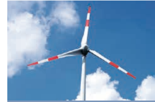
Environment & Energy